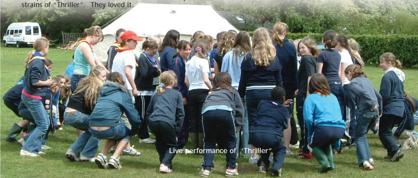
Live performance of 'Thriller'

As a first-timer at a Guide Camp, I was fascinated by the rigor with which groups were dispatched to wood patrol, latrines and to do their bedding rolls. Equally impressive was the way they were marshalled by their Guiders on time and in an orderly manner. When engaged in the Arts activities they lost no time in having a go at all on offer, taking on board suggestions and producing plenty of ideas of their own. It is always a privilege to see youngsters perform in front of an audience and the Talent Show on the Sunday night was a joy to watch. Individuals and groups pieces were interspersed with communal singing. The highlight of the Camp for me, though, was the camp fire, the like of which I had never witnessed before. Seasoned Guiders, some clad in badge encrusted blankets giving them a regal air, led the singing of old favourites as well as the brand new song Sue Mann wrote especially for the event, "Whatever the weather"- very appropriate, as it turned out. On Monday, we left happy and with dry tents under a blazing sun to drive back to home comforts and our mundane existence. To go to camp is to shrug off the dependence we all have these days on technology, to live something 100% absorbing for a short time and feel part of something unique.